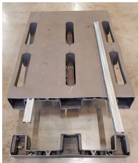
Placement of reinforcement beams (same pallet, but in grey color in this picture)